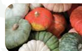
MIXED TIER 1

A pro-mix of pumpkins from this Tier 1 size selection 24" bin | 500-550 lbs